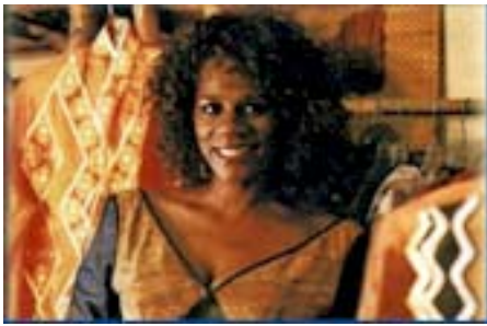
Designer Extrodiniare and Poet leading the Spoken Word