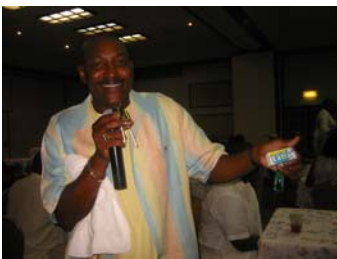
CM Jerome 3D