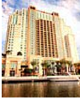
Marriott Tampa Waterside