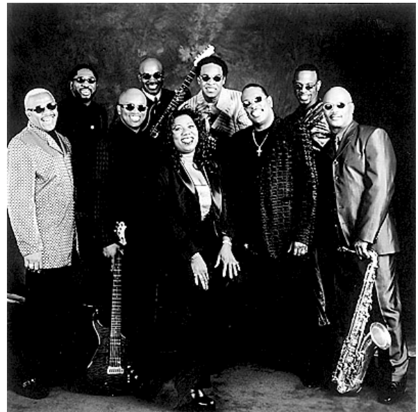
UNITED WE FUNK CONFUNKSHUN, THE BARKAYS, THE DAZZ BAND