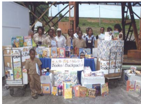
Book Donation at the Montego Bay Pier

This year we are happy to announce that our annual Children's Book Drive will be held in Grand Cayman. Each year we ask our Festival at Sea Passengers to be so kind as to bring one children's book with them to donate. We will send you a sticker to fill out and put in the book so the children will know who donated the book and what state and/or country they come from. So as you get ready for the cruise don't forget to bring a children's book with you. We have almost 3000 people. Let's try and reach a goal of 3000 new children's books for the Children of Grand Cayman.