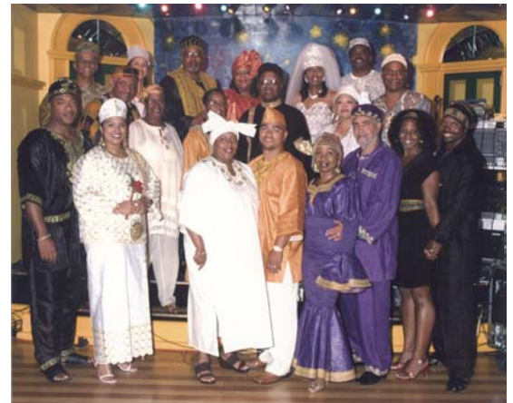
Renew your Vows on African Attire Night!

clothing while exchanging their vows. After your vows are taken, you jump the broom while a photographer snaps your picture. You will receive a Certificate as a memento of this wonderful event. Signups begin on April 1st. If you want to participate in this year's Renewal of Vows, go to www.festivalatsea.com and select "event signups" from the Caribbean 2010 drop down menu or give us a call at 800-466-2719.