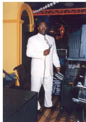
Otis Steel Karaoke