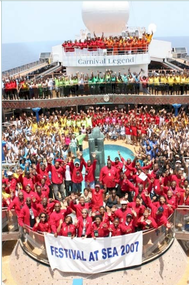
FAS 2007 Group Photo

Here is an update on the fuel surcharge. As we announced in our March Blue Notes, there will be a fuel surcharge added to your onboard account. The amount, will be determined by the price of a metric ton of fuel 30 days prior to departure. We estimated that the surcharge would be approximately $15.00 per adult passenger had oil prices had stayed the same. Obviously they have not. Since the price of fuel has continued to rise we will give you the exact amount when we send out our FAS Facts Newsletter with your final documentation.