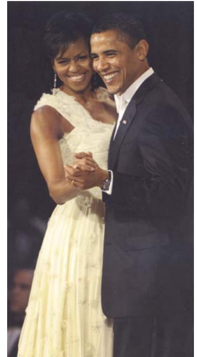
The President of the United States and The First Lady

AT LAST! On January 20th of 2009, history was made when Barack Obama was inaugurated as the 44th president of the United States. If you were not able to go to Washington DC and participate in one of the many balls, don't worry, we are going to celebrate this historic event Festival at Sea style on Wednesday, August 12th . Our committee's working hard at making this event reminiscent of that special evening. There will be dancing, decorations and a chance to look back on this historic evening that made us all so proud. We'll start the evening by sipping some champagne at the Captain's Cocktail Party, then a show in the Main Lounge with Eric Benet then maybe some ballroom dancing. Ladies, Mrs. Obama is a fashion icon, so make sure you show your style and maybe even your arms! Gents, President Obama style is very very COOL so make sure you represent. It is going to be a great evening to reminisce and dance the night away.