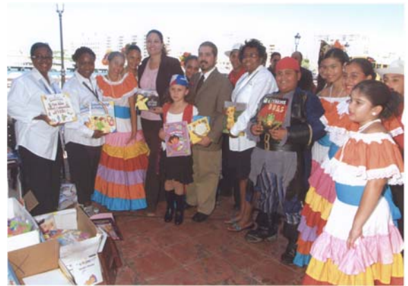
2008 Children's Book Drive was held in San Juan

We have almost 3000 people. Let's try to give the new Antiguan Library at least 3000 new books!