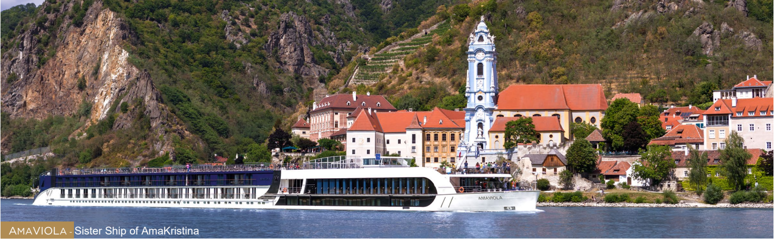
AMAVIOLA - Sister Ship of AmaKristina

AmaWaterways' twin balcony ships represent some of the newest vessels in our fleet. Heated pools with a swim-up bar provide a tranquil environment for viewing stunning mountains and spired skylines. Plus, spacious staterooms afford guests comfort and privacy to rejuvenate while still experiencing the magnificent scenery.