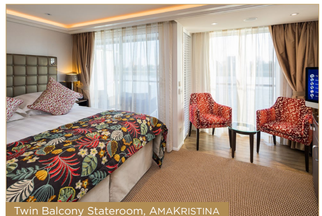
Twin Balcony Stateroom, AMAKRISTINA