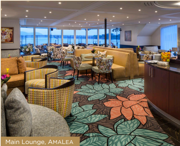
Main Lounge, AMALEA

AmaWaterways' twin balcony ships represent some of the newest vessels in our fleet. Heated pools with a swim-up bar provide a tranquil environment for viewing stunning mountains and spired skylines. Plus, spacious staterooms afford guests comfort and privacy to rejuvenate while still experiencing the magnificent scenery.